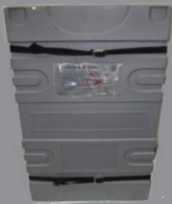
1 Pull the case to the location

Designed to protect health care workers while taking information in the screening process through a two level plexi speaking portal