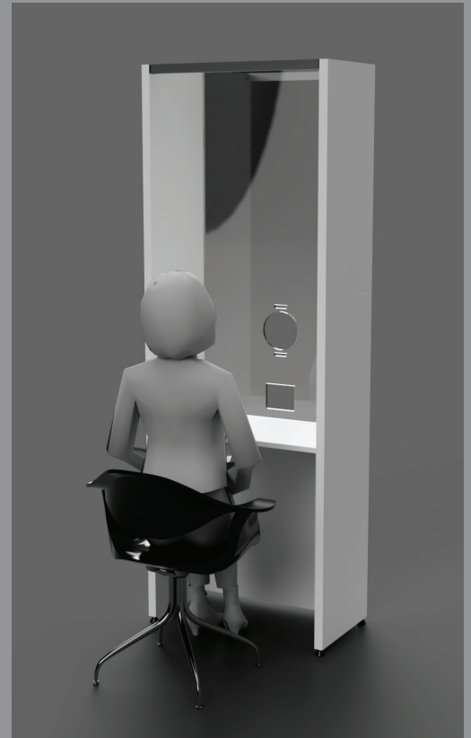
3 Attach the panels and plexi window